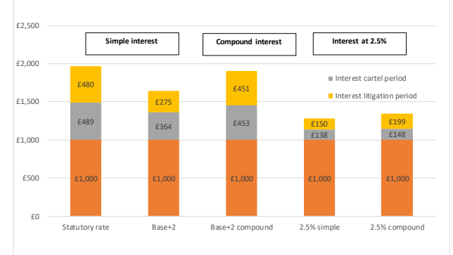
Figure 1: Interest awards at prevailing and current rates

Generally, the interest award will be greater the higher the interest rate, whether compound rather